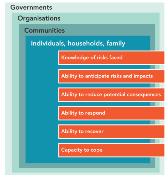
Figure 2: Features that effect the level of vulnerability and resilience

Please do not feel your submission needs to be constrained to the questions posed; you may wish to address the issues and questions below directly, or use these as a guiding prompt for additional ideas and consideration.